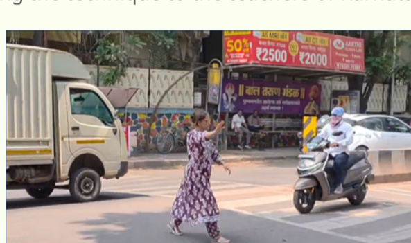
A teacher tries it out on the road