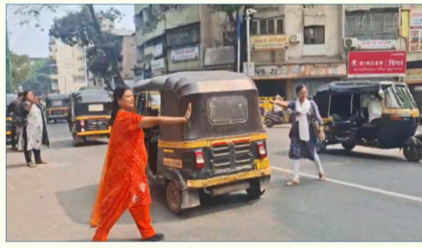
Teachers trying it out on the road